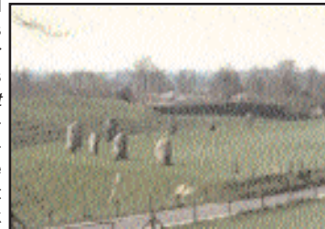
The Devil's Chair and Stone Circle and Henge in Avebury, Wiltshire.

The Virtual Walkabout is a virtual reality tool that allows users to explore archaeological sites. It contains an archive of images from the prehistoric henge complexes at Avebury and Beaghmore which can be explored online. It also allows users to create their own virtual walkabouts using the Walkabout Generator and contains a tutorial for students who can use the concept to support their own fieldwork training.