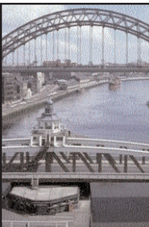
The Tyne and Swing Bridges.