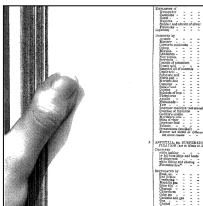
Figure 2: Poorly cropped image

Issues relating to scanning quality are frequently alluded to in the IHR’s survey. The quality of a reproduction of a published volume should not be considerably lower than the original. Quality assurance is a tedious, but necessary process in digital resource creation projects. The thumb in the image in Figure 2 received by the OHPR project carried out at AHDS History does not obscure any of the information within the image, but is off-putting and demonstrates a lack of care. In sites which